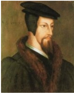
John Calvin in his youth

Calvin was thought by some to have written the address and was forced to flee the capital, first going home to Noyon, then to Orléans.