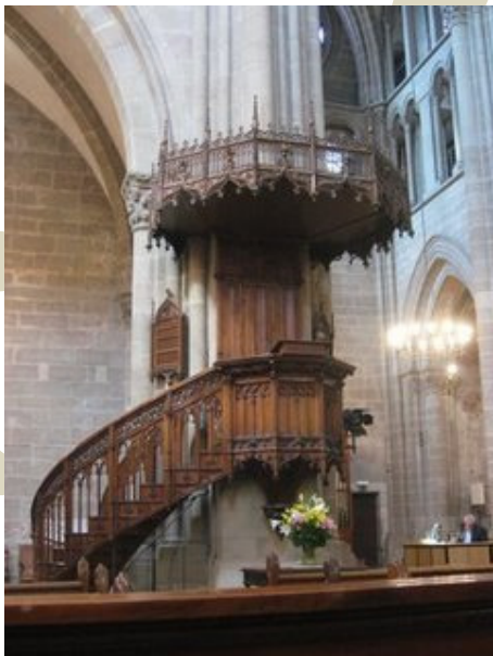
A reconstruction of the pulpit at St Pierre's Cathedral, from which Calvin preached

One of the most controversial incidents in Calvin's life was the execution of Michael Servetus on charges of heresy.