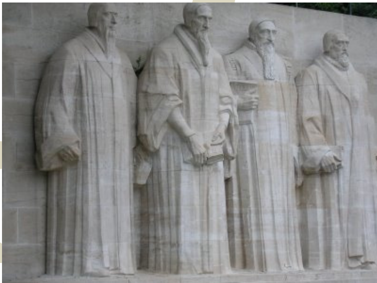
William Farel, John Calvin, Theodore Beza and John Knox in sculpture on the Reformation Wall at the University of Geneva, built in 1909 to commemorate the 400 th Anniversary of John Calvin's birth and the 350 th Anniversary of the establishment of the University.