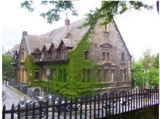
John Calvin's Academy in Geneva

Calvin's influence reached much further than theology and politics. He built Geneva's reputation as a city of learning by building schools and a university, a legacy which has accompanied Reformed theology to many places, including notably to Scotland. He also proposed a different definition of usury, which the Roman Catholic Church had defined as the lending of money at any interest. Calvin taught that money could be lent at interest, as long as the rate charged was in proportion to the expected return. This laid a foundation for modern capitalism (interestingly, Calvin considered interest above 1% to be unreasonable).