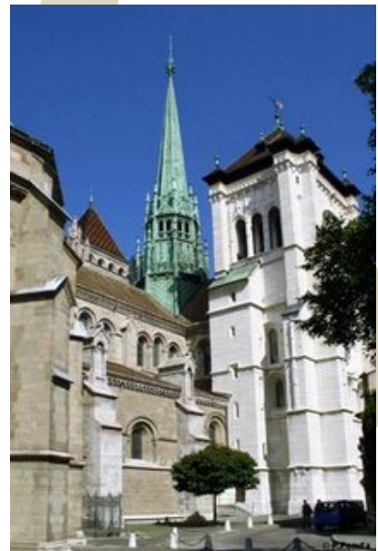
St Pierre's Cathedral, Geneva

Between then and his death in 1564, Calvin preached and wrote prolifically, welcomed in refugees from many nations and trained them to return to reform the church. He continued his work reforming the church and city structures. It should be noted that Calvin was never the ruler of Geneva, although many, not all, of his ideas were adopted by the widely democratic city councils.